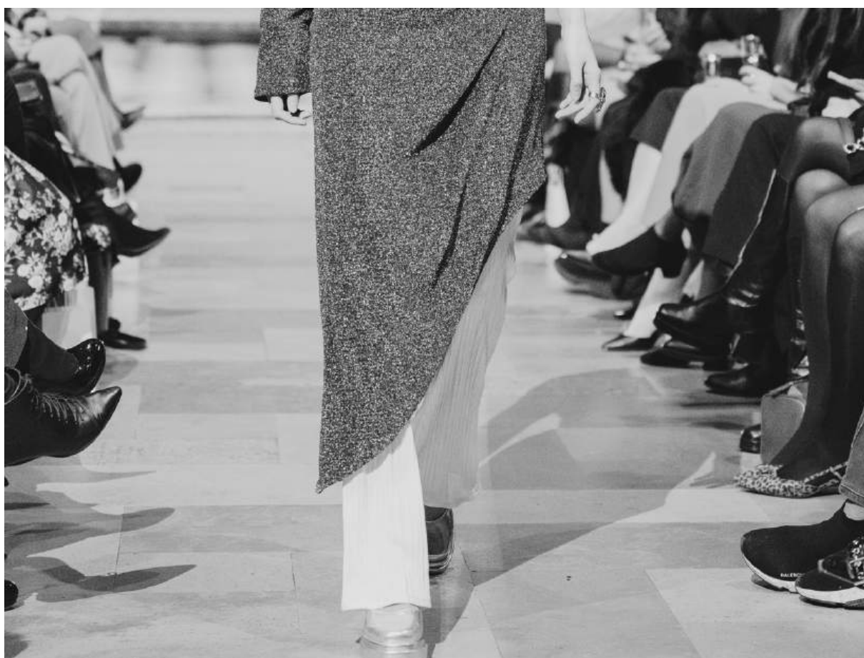
Dress & Pants Brilliant feeling