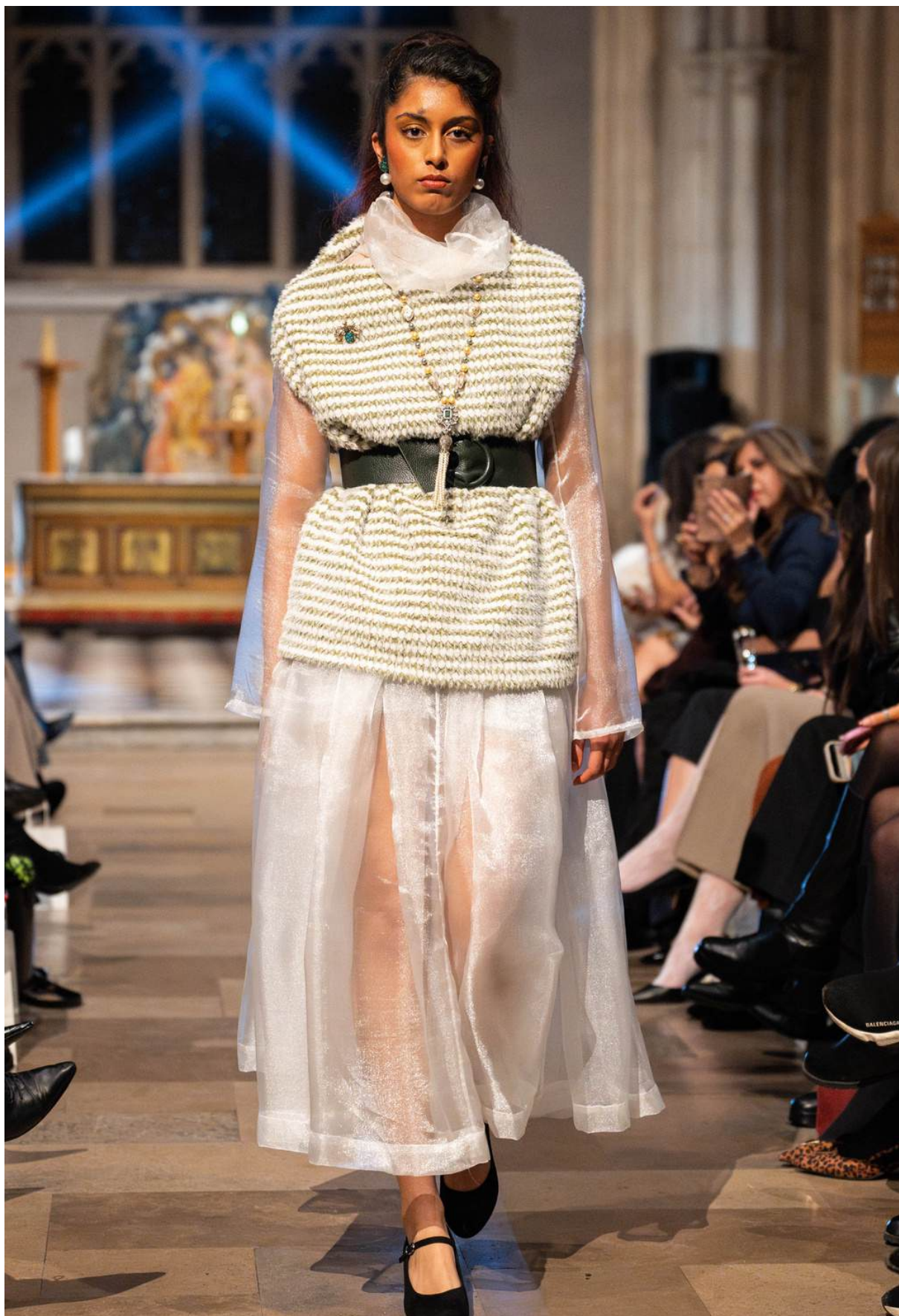
Shadow Dance Set