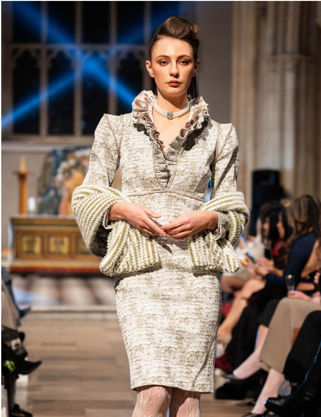
Starlit Path Dress