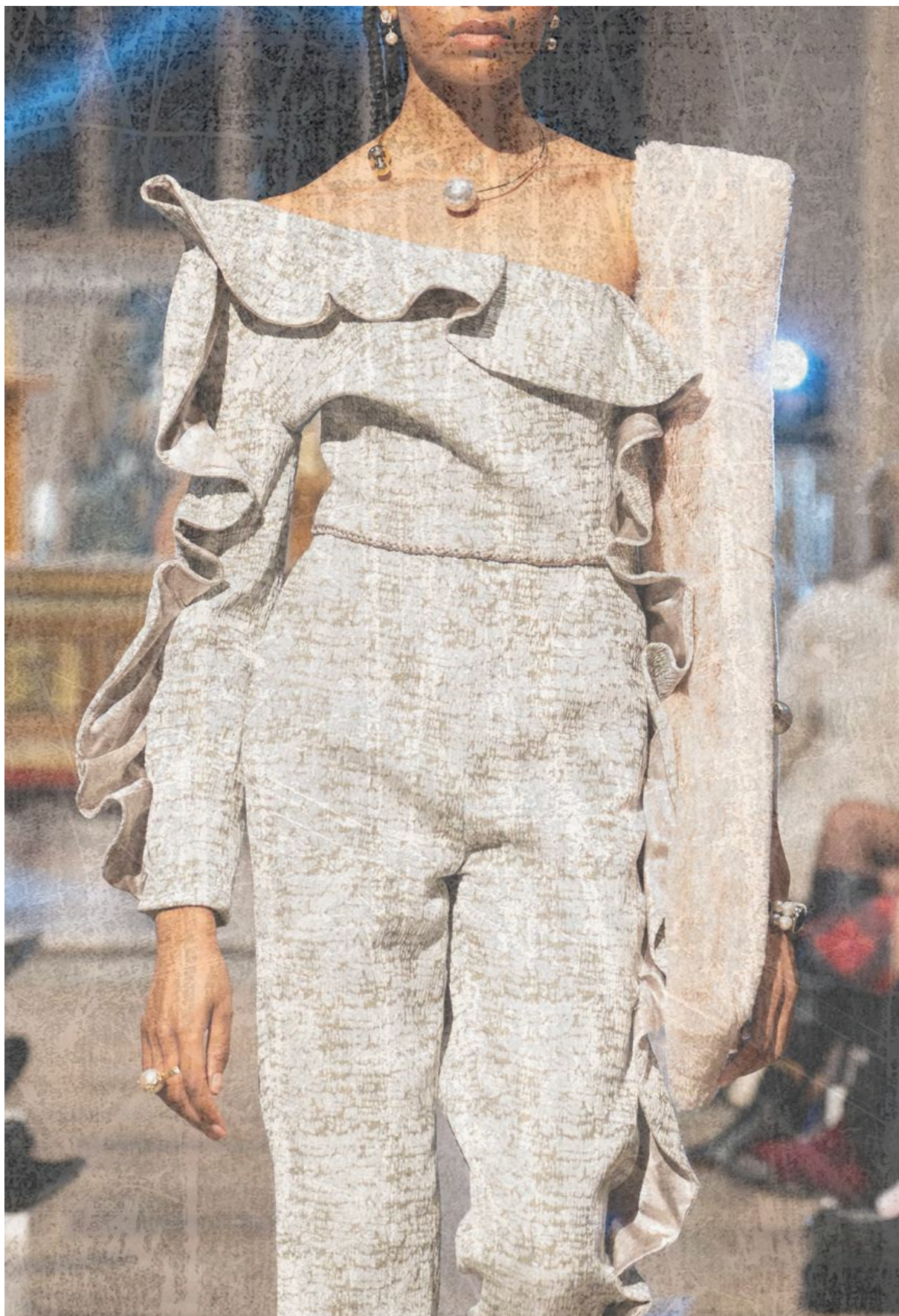
Modern Legacy Jumpsuit